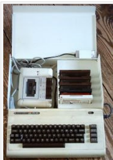
The VIC-1020 expansion chassis with cartridge slots occupied & showing space for datasette storage. Note also the RF modulator bracket.

Slot expanders such as this allowed the simultaneous use of several cartridges on a single VIC-20. This allowed features of utility cartridges (like the Programmer's Aid cartridge) and RAM expanders to be combined. Unlike some other slot expanders, however, the VIC-1020 lacked switches to enable or disable individual cartridges - meaning cartridges had to be physically removed to disable them. This emphasizes what seems an apparent design flaw of the VIC-1020; the monitor needs to be lifted off the chassis and set aside to enable the user to open the lid and access the extra cartridge ports - a cumbersome process if repeated often.