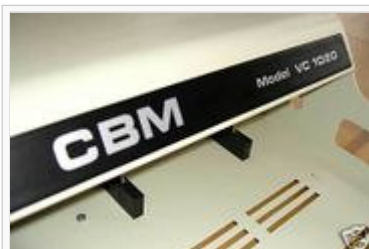
The VIC-1020/VC-1020 label is very similar to that used on the PET computer.