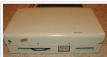
The VIC-1020 expansion chassis showing hole for rear expansion slot. The VIC-1020 in this photograph is missing its internal circuit board.