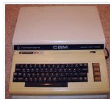
The VIC-1020 expansion chassis.

The VIC-1020 (known as the VC-1020 in Germany) expansion chassis is a large metal enclosure which provides the VIC-20 computer with six additional expansion slots for cartridges (five pointing upward and one lying horizontally and pointing toward an opening on the back of the VIC-1020). The entire VIC-20 computer is placed into the VIC-1020 and a male edge connector on the 1020's slot expansion board is mated with the VIC-20's internal cartridge port. A monitor can be placed on top of the VIC-1020, giving the entire setup a PET computer-like appearance. Indeed, the black "CBM" label across the front of the VIC-1020's casing is similar to that used on the the PET line of computers. The choice of sheet metal for this enclosure seems natural, as Commodore had a sheet metal fabrication plant for the production of office filing cabinets and desks.