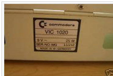
The VIC-1020 model & serial number sticker.

Retrieved from " http://sleepingelephant.com