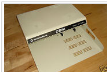
The VC-1020 expansion chassis (name used in Germany). Note the hole on the right hand side of the chassis to allow access to the VIC-20's power & joystick connections.