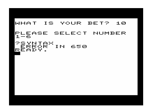
Figure 3-1. The First Error

If you have typed the program as it is indicated above, the screen will appear as shown in Figure 3-1.