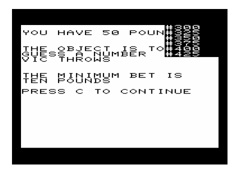
Figure 2-2. The Screen During Single-step

program is executed and the first line number of the next instruction displayed in the window.